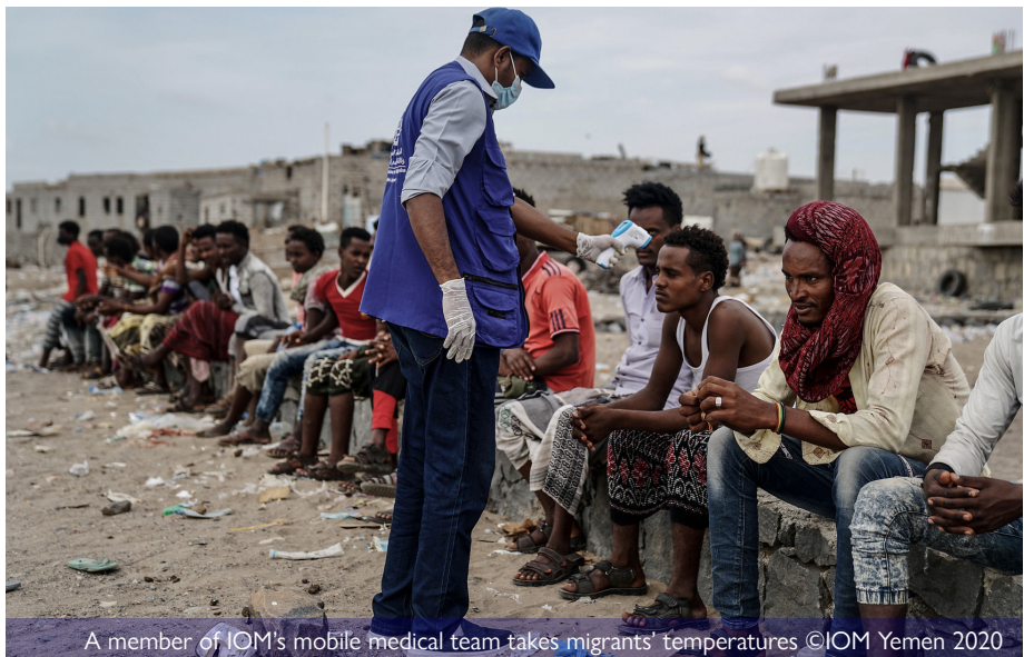
A member of IOM's mobile medical team takes migrants' temperatures

IOM will further strengthen protection monitoring activities as a critical complementary activity that allows IOM to work with communities to define protection services but also to bridge a critical gap that exists within the humanitarian response on understanding differential risk that can be used to guide better targeting of humanitarian aid in a protection sensitive manner. Protection monitoring will cover issues and concerns in the specified location or context, such as access to adequate shelter, health, livelihoods or civil documentation, risks and threats, incidents such as SGBV, child protection, the capacities and self-protection and coping mechanisms of the specified population group(s).