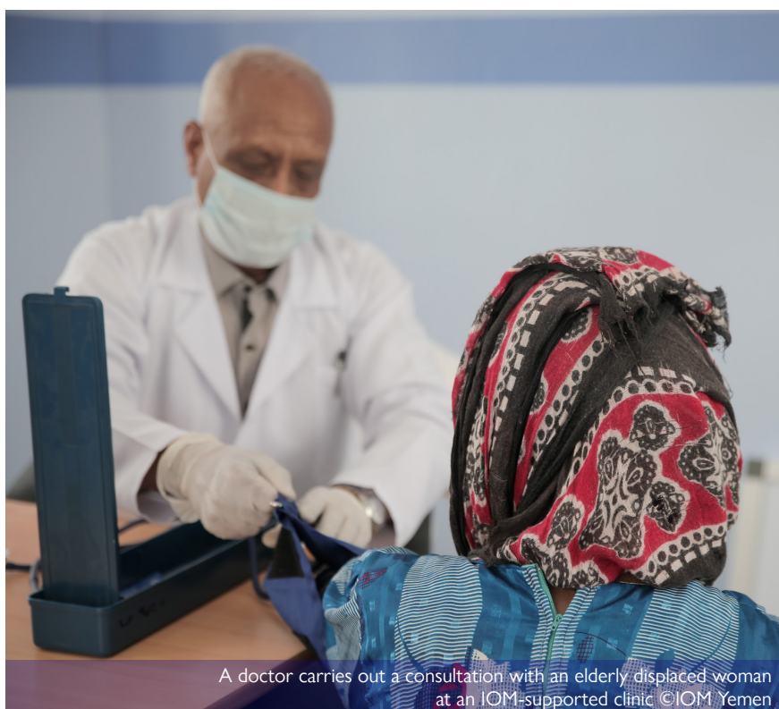
A doctor carries out a consultation with an elderly displaced woman at an IOM-supported clinic