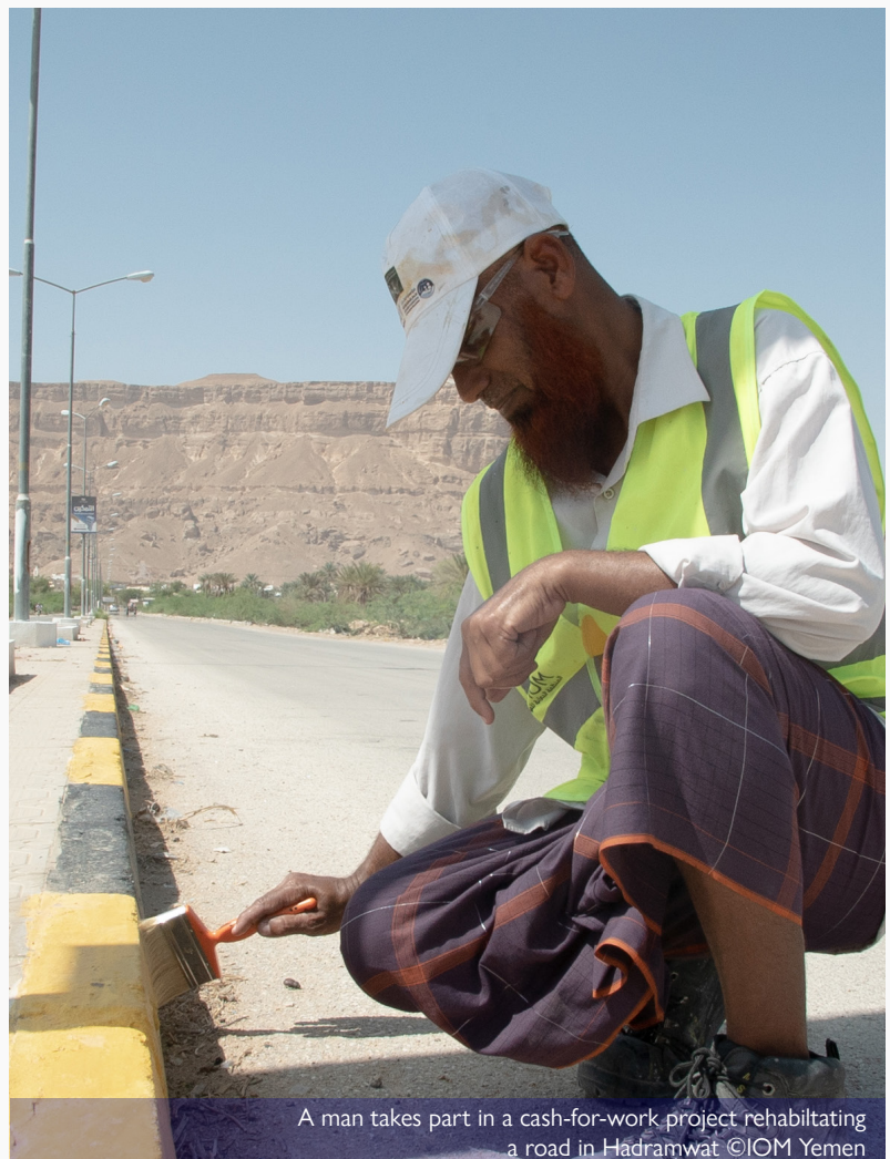
A man takes part in a cash-for-work project rehabilitating a road in Hadramwat

As part of IOM's monitoring and accountability priorities, all cash distributions are carried out through banks that have been appropriately vetted by IOM to serve as low risk and compliant financial service providers, while cash activities are monitored either through direct presence or third-party monitoring teams. IOM third party monitoring teams will be utilized to conduct verification, distribution monitoring and post distribution monitoring, after which a harmonized and comprehensive Post-Distribution Monitoring (PDM) survey will be conducted with a representative sample. In line with efforts to ensure accountability to affected populations, IOM provides beneficiaries with a feedback mechanism, whereby beneficiaries can report any irregularities or needs that may arise throughout implementation. This is done through the provision of a hotline number, WhatsApp, Facebook and email. Results of the PDMs and the feedback mechanisms are systematically shared with the cash programming stakeholders to help analyze potential shortfalls of the interventions and needs for adjustment. Importantly, the Organization has worked on harmonizing partner targeting and monitoring tools through its role as co-lead of the Cash Consortium of Yemen (CCY) (together with DRC) and the Rapid Response Mechanism Sector (RRM) (together with UNFPA). These efforts allow IOM and partners to improve programming through lessons learnt and good practices (quality, quantity and appropriateness).