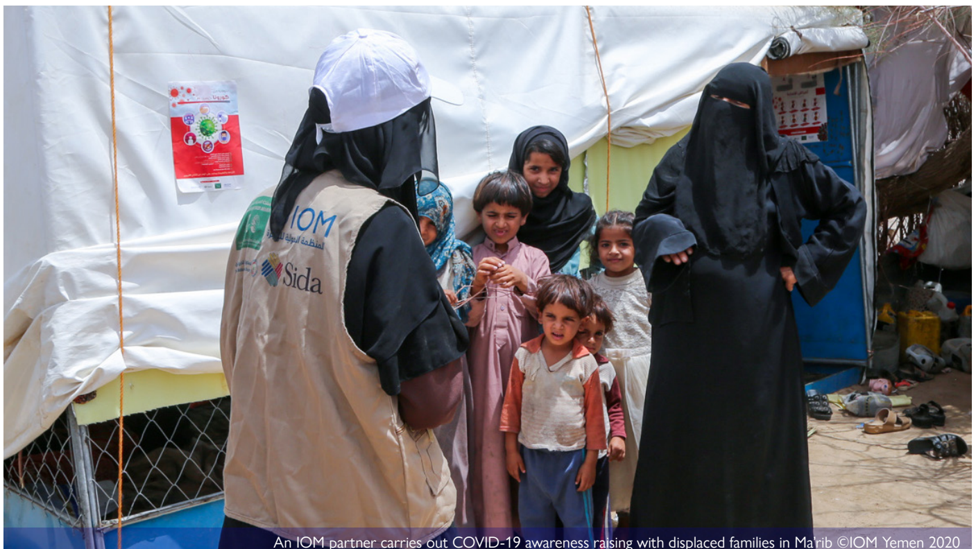
An IOM partner carries out COVID-19 awareness raising with displaced families in Ma'rib