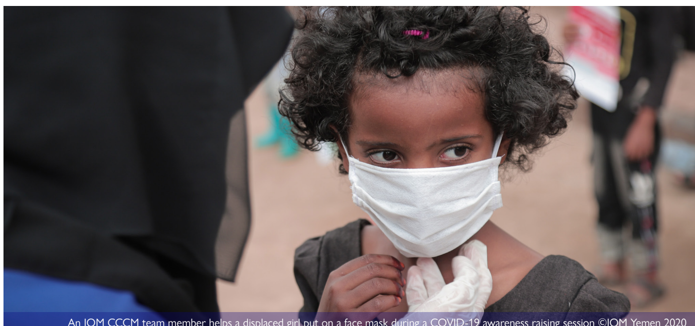
An IOM CCCM team member helps a displaced girl put on a face mask during a COVID-19 awareness raising session