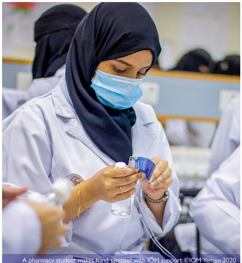
A pharmacy student makes hand sanitizer with IOM support