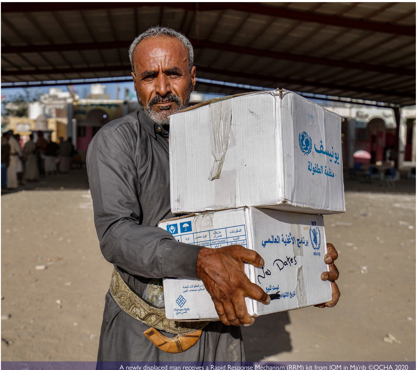
A newly displaced man receives a Rapid Response Mechanism (RRM) kit from IOM in Ma'rib